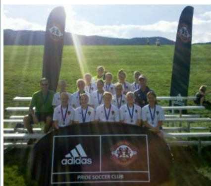
Premier '97 Girls (U15 Girls Premier)