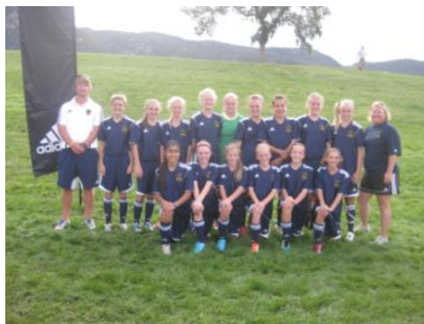
Premier '99 Girls (U13 Girls Premier)