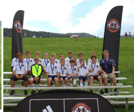
Premier '00 Boys (U12 Boys Premier)